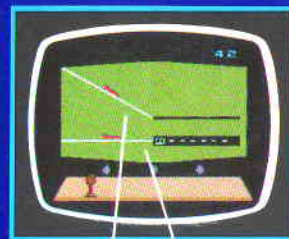
GLIDE PATH LOCALIZER