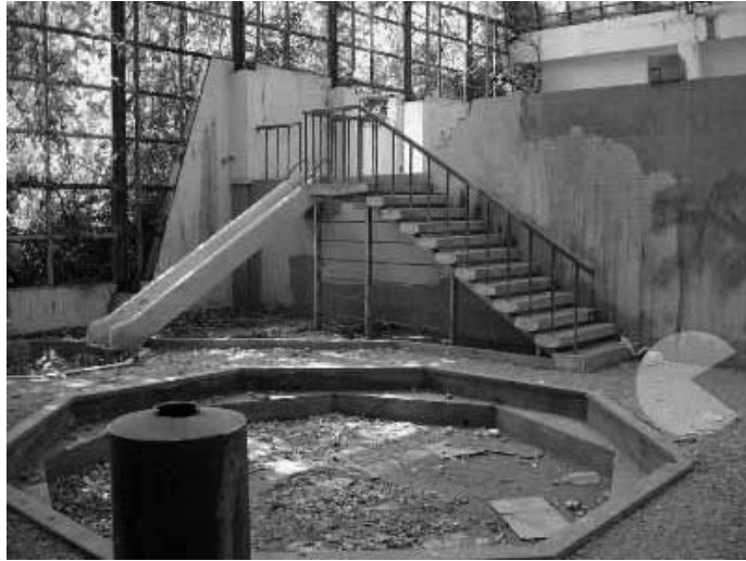
Notice the strange markings on both the jar as well as the lid.