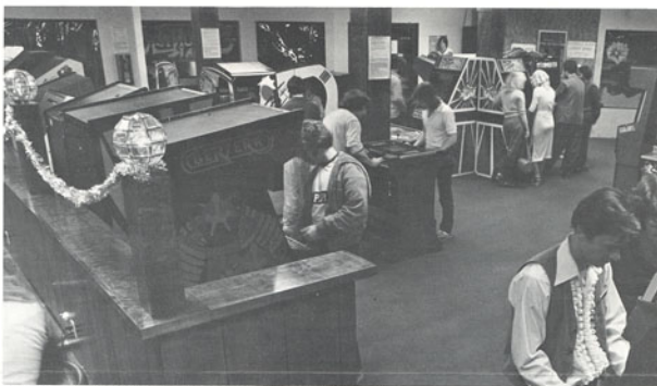
A typical evening at the Encounter Zone in Cotati, California.