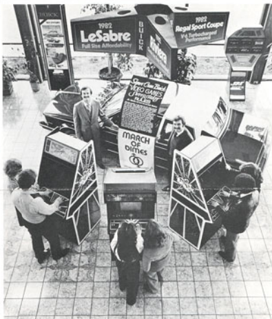
Centipede™ and Tempest™ games are a new addition to the Signer-Cram Buick showroom floor.

Signer-Cram Buick of Fremont, California, a progressive car dealership, is sponsoring a promotion using ATARI coin-operated games to benefit the March of Dimes. The rules are simple: Any driver 21 or over can play an ATARI video game and qualify for a chance to win a crisp, new $1,000 bill. The last five digits of a contestant's score are recorded, and the