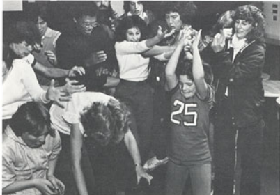
Some enthusiastic game players participate in the "Great American Token Grab".