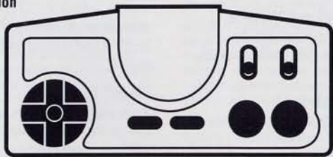
Direction Key SELECT Button RUN Button Button II Button I