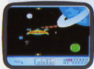
MOTHER SHIP ARRIVING

When your Spectron is about to run out of fuel, your Mother Ship will appear, preceded by several musical notes. When this ship appears, be prepared to intercept the Energy Pack that will be dropped by parachute. In order to refuel, you must catch this pack by moving your Base Laser so that it is directly below.