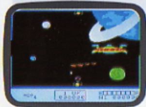
CATCHING ENERGY PACK