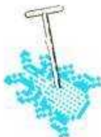
Roach 2000 points (fast bug) 500 points (slow bug)