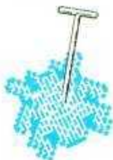
Weevil 1000 points