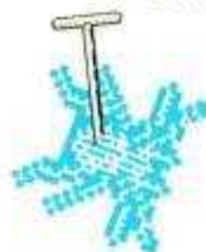
Spider 2000 points