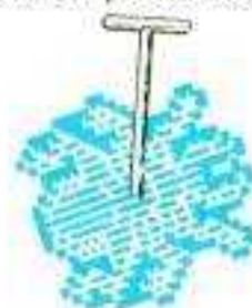
Termite 1000 points