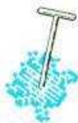
Ant 3000 points