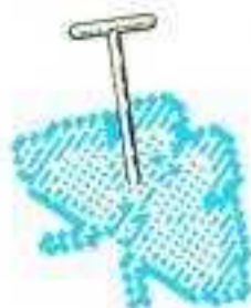
Butterfly 300 points