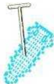
Caterpillar 2000 points (fast bug) 500 points (slow bug)