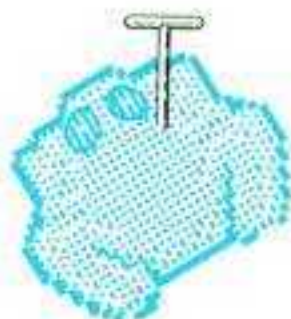
Frog 100 points