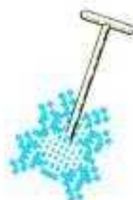
G-Bug 2000 points