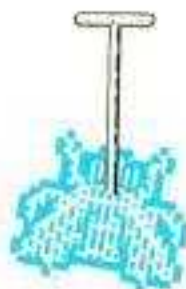
Fly 300 points