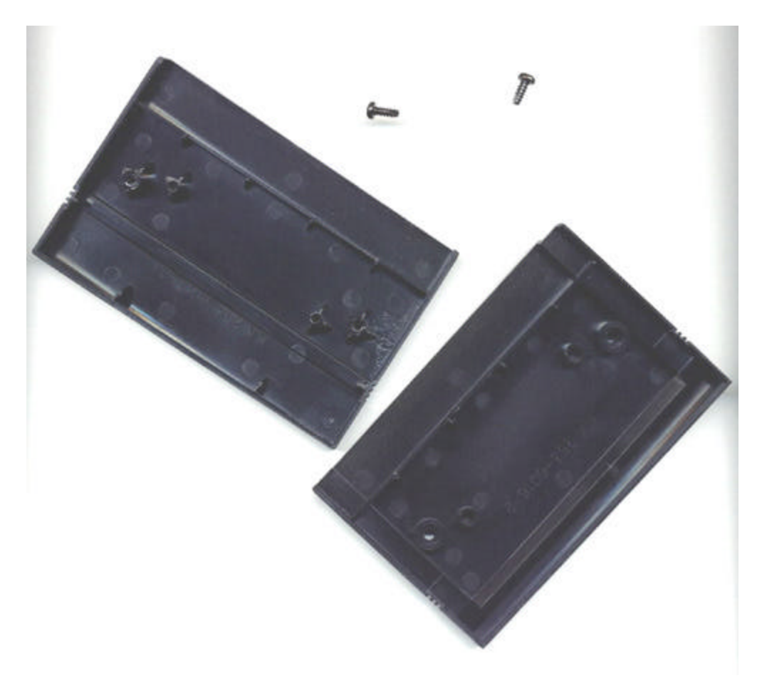
Fig 3.--Inside of casing, showing all internal components. Note Sega engineers' prescient use of philips head screws (shown, top center) --an innovation which greatly facilitated the existence of the Snail Maze cartridge.

The cart works like any other SMS cartridge, with the added benefit of a "security code". This cart requires the input of a secret code to enable it's play. This will undoubtedly come in handy when trying to prevent your friends or younger siblings from monopolizing the Snail Maze playtime. Once your friends and family have shown restraint in their Snail Maze playing habits, you may wish to share the security code with them. It's easy to remember! When you see the Snail Maze title screen (which strangely says "WELCOME TO SEGA MASTER SYSTEM"), you input the security code! Using controller one, hold "up", and press both buttons. Voila! You've correctly bypassed the Snail Maze security interlocks, and you're ready to play!