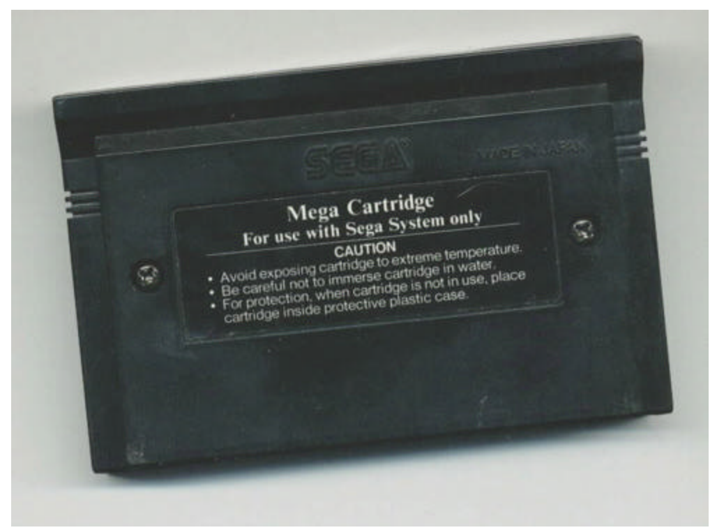
Fig.2--Snail Maze rear casing

The Snail Maze cartridge is ingenious in it's design, as it's hollow-core construction, once inserted into the Power Base, allows the SMS to play "Snail Maze" (a game previously only accessible when the cartridge port was closed). The foresight present in the Sega engineering team (see figure 3) is astounding, without which this technical feat would be difficult or impossible.