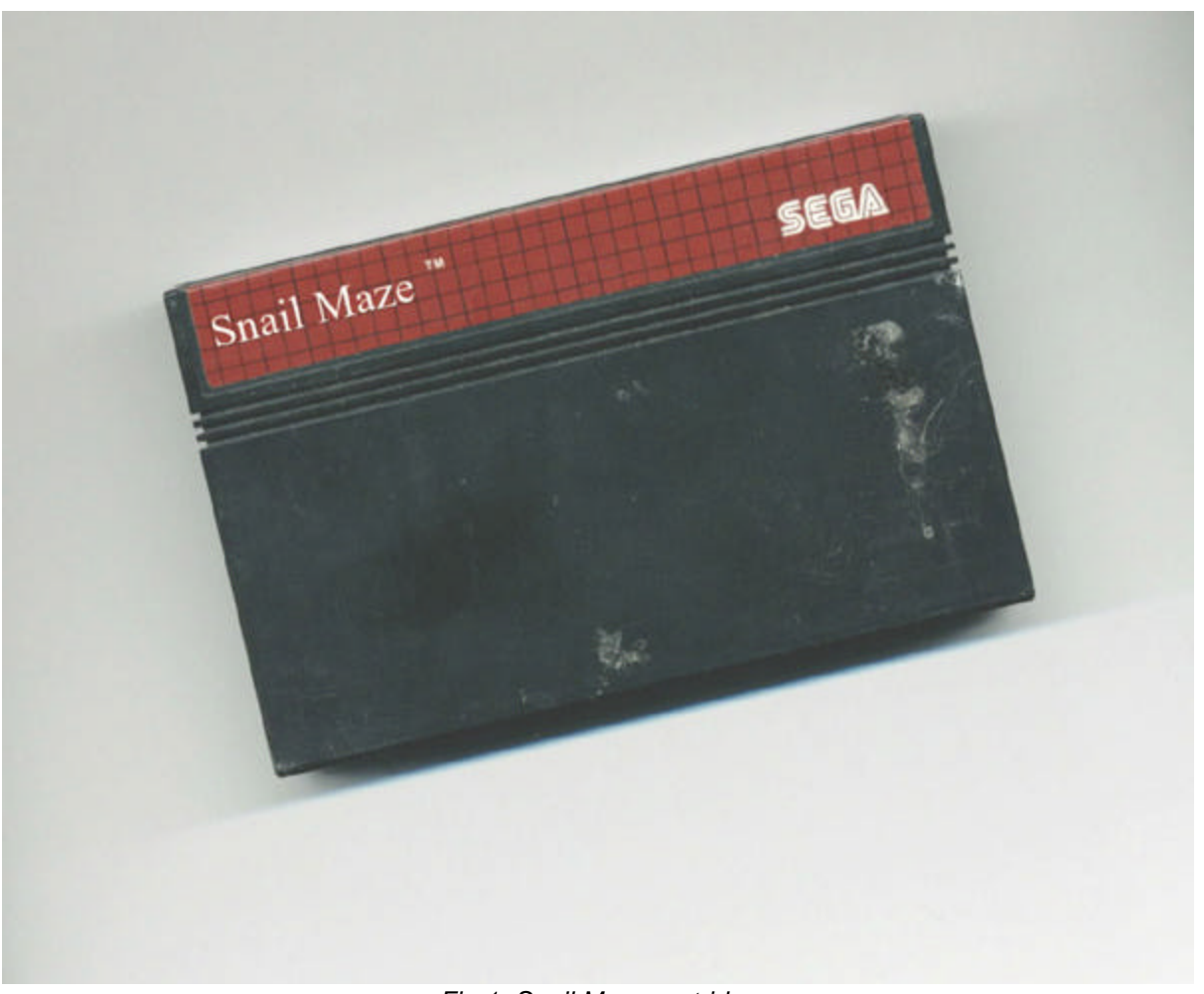
Fig.1--Snail Maze cartridge

As you can see, the cart seems to be in generally good shape. There is a bit of adhesive residue on the casing, but I didn't pursue it's removal, as I felt that I had already expended some time and energy on this project to begin with.