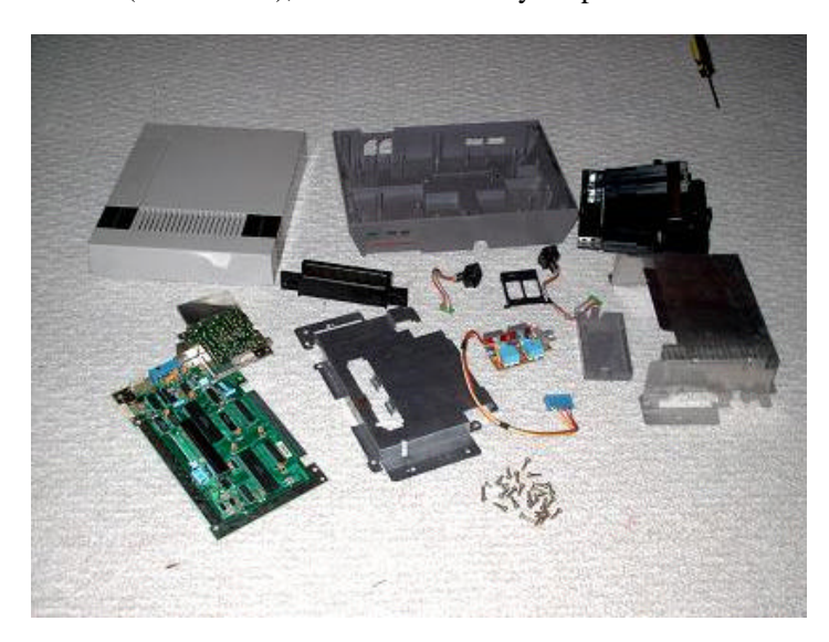
If needed, assembly instructions are $10 extra and will be in the form of a link to another website.

So, the project is putting it back together and seeing if it works. This is one of the many Nintendo systems I had laying around in general phases of testing. This one has just been finished being cleaned and is ready for reassembly and testing. Everything seen below is included with the exception of the screwdriver, the pile of screws (read below), and the semi-dirty carpet.